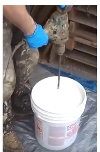
Figure 8: Mixing Base Coat