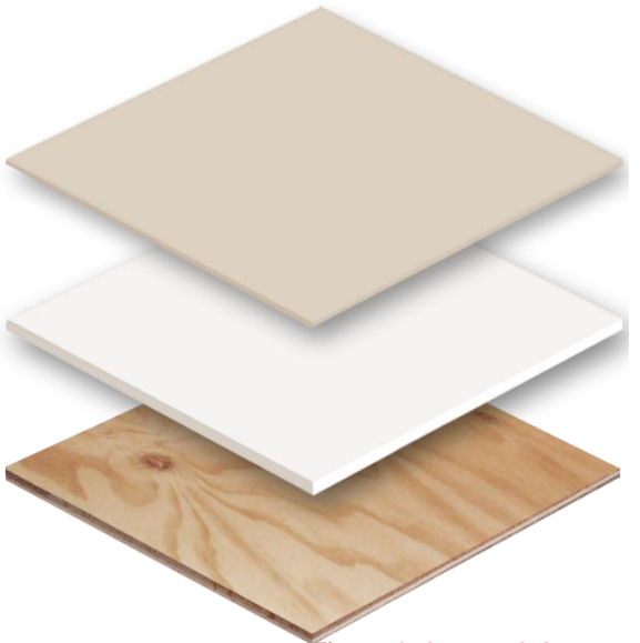
Figure 1: System S Components

<u>System-S</u> consists of 2 layers – Tuff Base and fade resistant UV stable AL Colour Coat (several colour choices) (2-step application process)