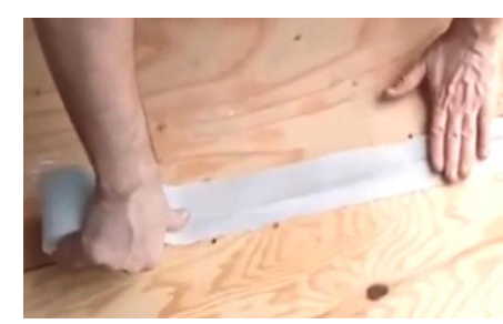
Figure 2: Installing Seam Tape