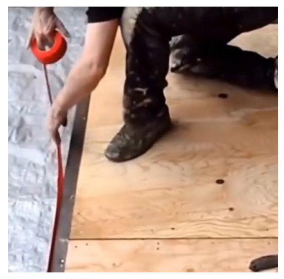
Figure 5 - Installing Red Poly Perimeter tape