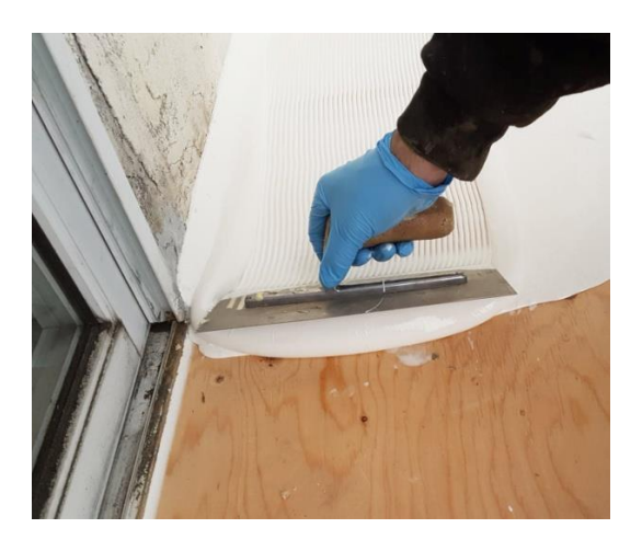
Figure 7: Spreading Base Coat