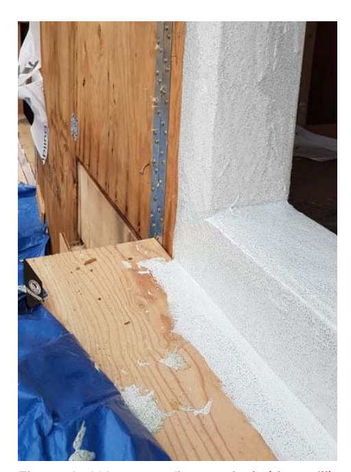
Figure 6 - Waterproofing verticals (door sill)