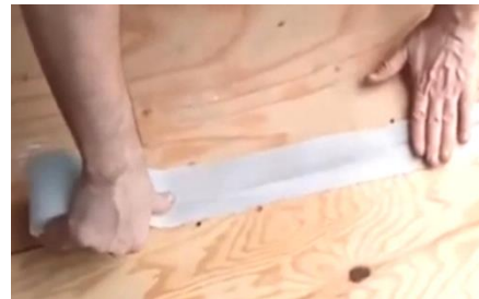
Figure 2: Installing Seam Tape