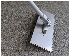
Figure 9: Trowel Adaptor

The custom angle adaptor is threaded to allow installers to fasten a pole to the trowel making spreading the product over large areas easier and more efficient.