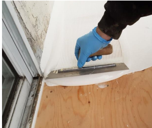
Figure 7: Spreading Base