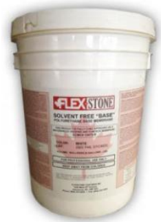
Figure 4: Base Coat Pail

A Small Vial of Green catalyst is available for each pail of Base coat to help it reach a full cure quicker.