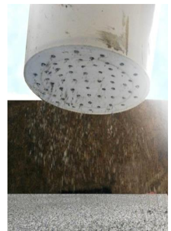
Figure 11: Dispersing Chips