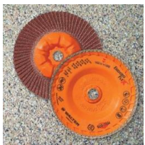
Figure 10: Grinding Disc

Before rolling out your top coat and/or distributing the blended acrylic chips, take your time conducting touch-ups (if there are any) to the base coat. For minor marks the colour flakes help to hide them but may will not hide everything.