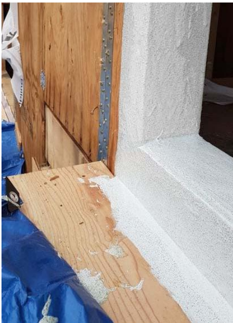
Figure 6 - Waterproofing verticals (door sill)