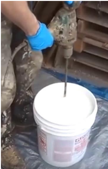
Figure 8: Mixing Base