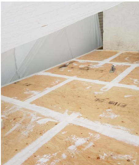
Figure 3: Finished Seam Tape