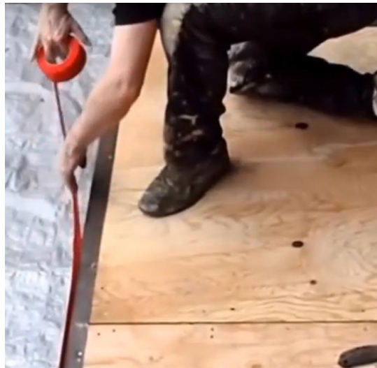
Figure 5 - Installing Red Poly Perimeter tape